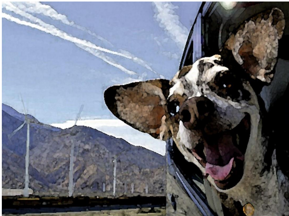
Michelle Carter's "How to Pray" Comes to Catskill's Bridge Street Theatre